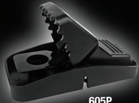
605P EASY SET MOUSE TRAP