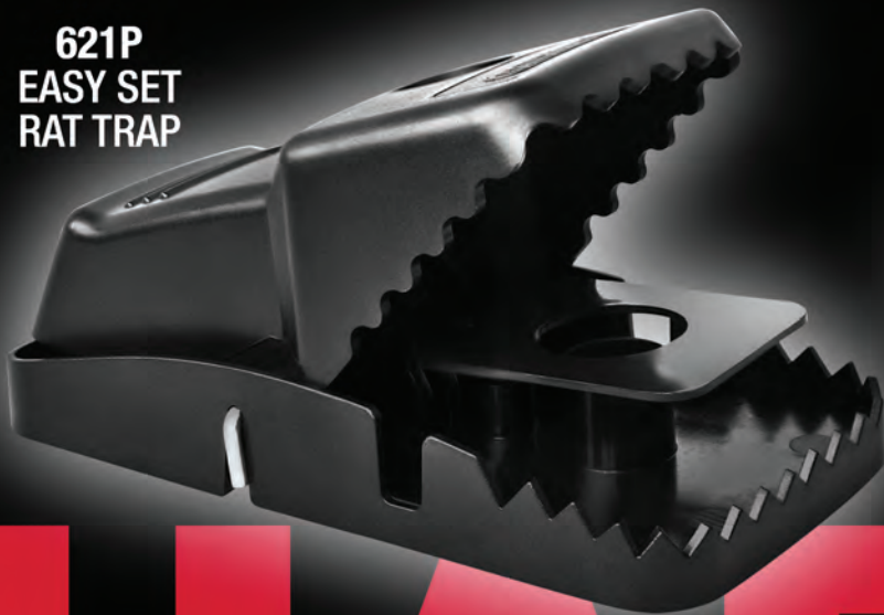
621P EASY SET RAT TRAP